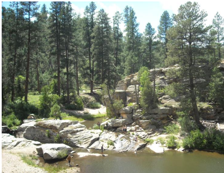
8-28-2010 Kinder Crossing Photo